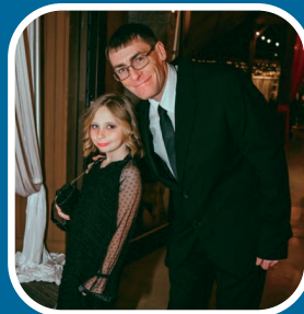
Shout out to Her Knight Dance, for inviting Fatherhood Initiative dads to treat their daughters to an incredible daddy-daughter evening!