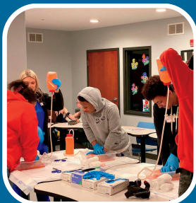
Local high school students learn how to stop severe bleeding wounds during Leadership Academy's youth summit at Woodhill Community Center!