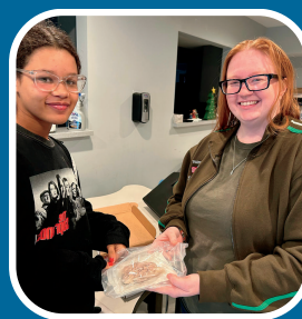
An Amachi mentee explores her interest in medicine by dissecting a sheep's brain, thanks to her dedicated mentor!