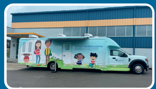
Kentucky Children's Hospital partners with Urban Impact at the Woodhill Community Center, providing free, vital healthcare to local neighborhood youth through their mobile clinic every Tuesday!