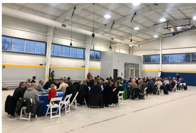
Above: Pastor's Prayer Breakfast

Over the past year a group of pastors, ministry leaders, and intercessors have been praying together at The Prayer Room every other Tuesday at 7am. The Lord has catalyzed within our hearts a desire for awakening and renewal in the Body of Christ and beyond. We're seeking Him to help us mobilize corporate prayer, craft a sustainable strategy for carrying the Gospel throughout the whole city, forge deep connectivity among pastoral leadership, and give ourselves to one another relationally for the purposes of racial reconciliation.